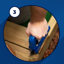
Place on the board

Set the desired distance between the boards.